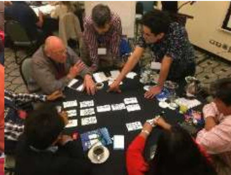
LATIN AMERICA WF WORKSHOP Lima, Perú