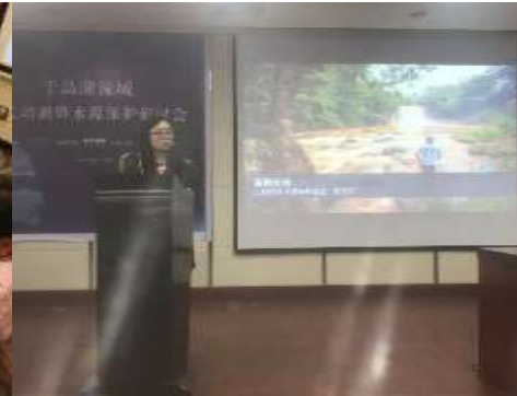
CHINA WF WORKSHOP Qiandao Lake Zhejiang Province, China