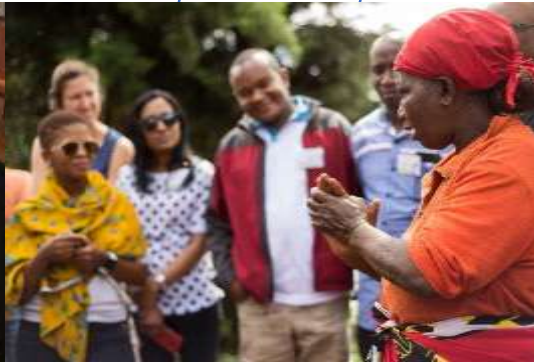
AFRICA WF WORKSHOP Nairobi & Nyeri City Kenya