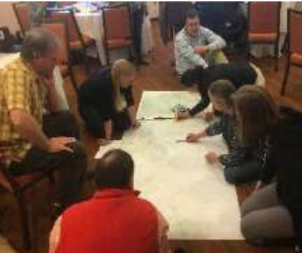
WESTERN USA WF WORKSHOP Santa Fe, NM

The Nature Conservancy and its partners are demonstrating leadership by building the capacity of new organizations and communities, supported by robust curriculum that has been tested in multiple global geographies.